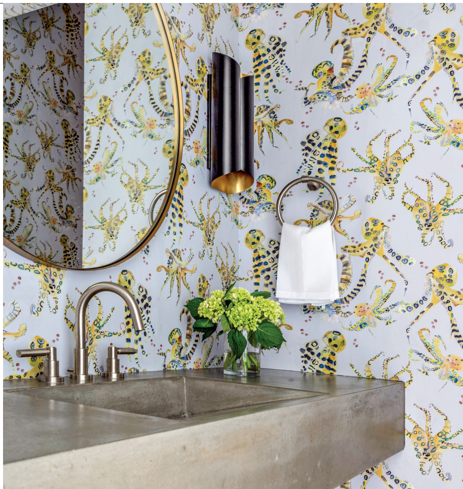
COOLEY PHOTO: KERRY KIRK PHOTOGRAPHY. CALLI PHOTO: COSTAS PICADAS. HEPFER PHOTO: VIRGINIA MCDONALD PHOTOGRAPHY.