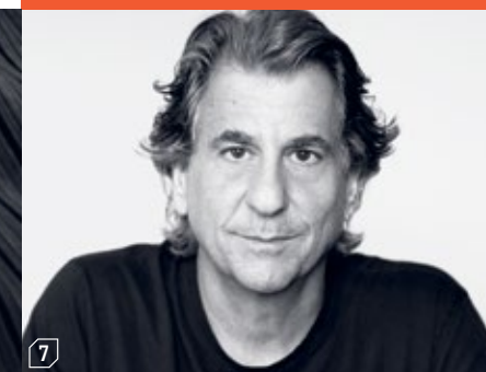
Paul Smith for Maharam