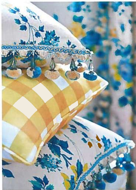
KIM HOEGGER HOME's New Cottage Collection features florals, stripes and checks that ring nostalgic in a happy, modern way.

Textiles are easy to crush on, as is the indomitable entrepreneurial spirit of the seven women whose fabrics are represented on this page. In one fashion or another, they have gone through hoops, experimented tirelessly, and researched age-old techniques in order to provide beautiful, customizable cloth. They have got you covered!