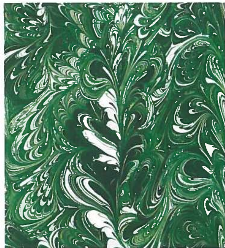
JILL SEALE studied the ancient art of marbling in Florence, brought the craft back home, and is applying it to contemporary product design.