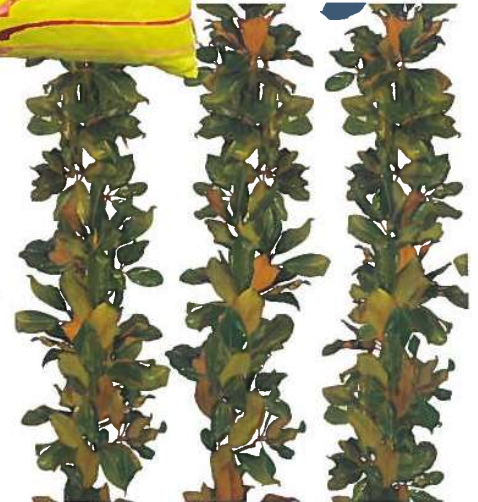
DENISE MCGAHA's collab with Design Legacy's Kelly O'Neal includes Belle Stripe , created with her grandmother's magnolia tree in mind.