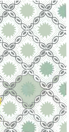
HABLE's charming French Sun makes a fab base for layering African striped throws, Bolivian horse blankets or Indonesian ikats.